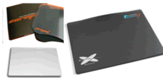
Figure 1. The Corepad (top left), the G-pad by Maxtill (bottom left), and Thunder 9 (right)

The Corepad (rougher surface) was 280 x 200mm and made of glass with "fencing" branded in to create texture. The G-Pad by Maxtill (smoother surface) was 265 x 215mm and made of frictionless tempered glass. The Thunder 9 by X-Ray (moderately smooth surface) was 291 x 236mm and made of rigid ABS material. The traditional mouse pad was 270 x 215mm and made of foam with a cloth surface. The table used had a 36 X 18" desktop area made of a low-glare Formica. The experimental apparatus consisted of a PC running Linux, a 21-inch monitor running at 1400 x 1050 with a resolution of 100 DPI and a refresh rate of 85 Hz, and a Logitech® MX™300 Optical Mouse (800 DPI).